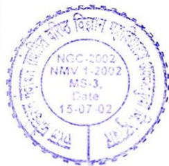
Principal Rural Foundation Nandurbar Sanchalit Senior Science College Akkalkuwa, Dist. Nandurbar